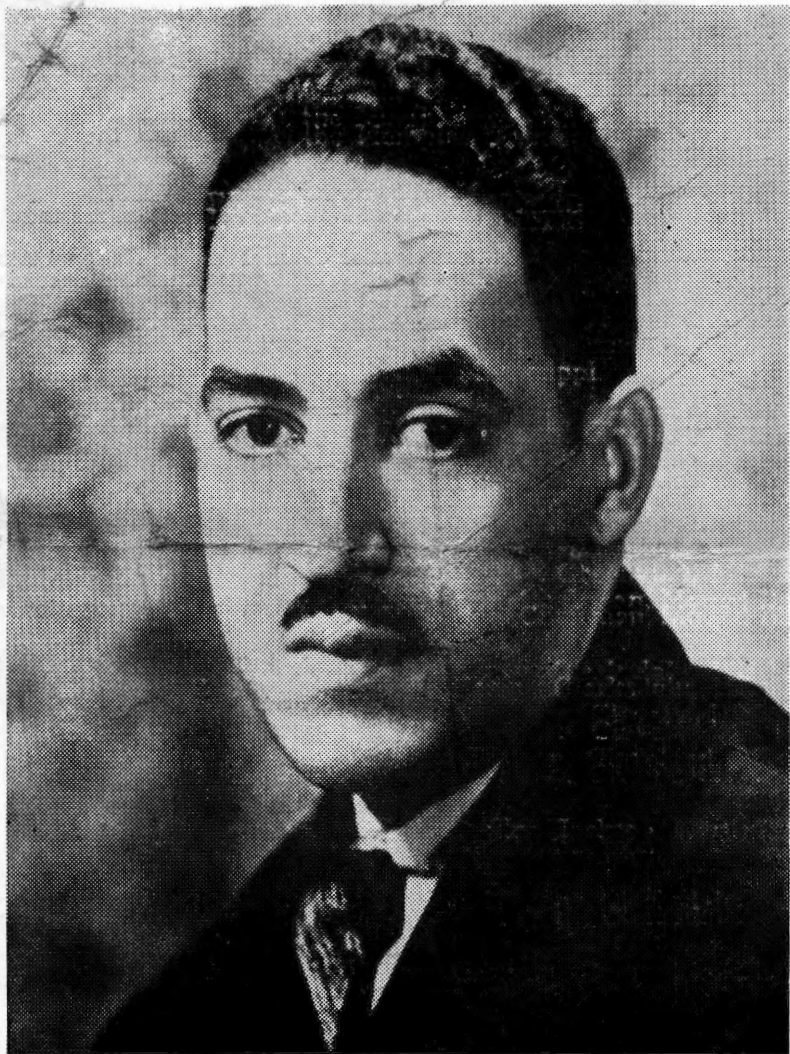
HON. THURGOOD MARSHALL