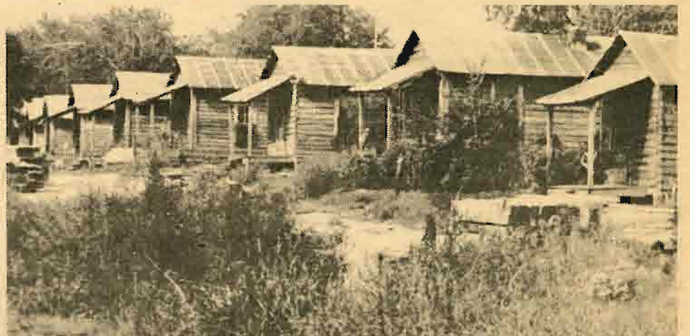
FARM WORKERS' HOUSES in West Point, Mississippi.

The homeless among the occupants are now staying at Strike City. They have sent word to all poor people to join them there.