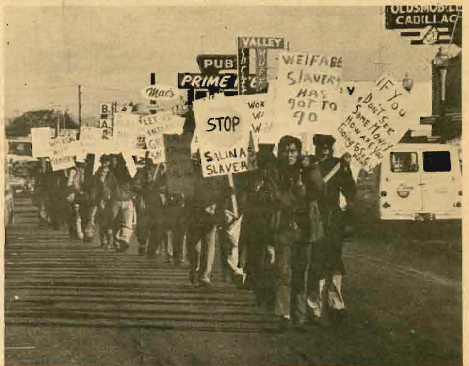
SALINAS FARM WORKERS march on Welfare Office.