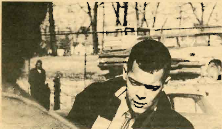
JULIAN BOND talks to reporters in Atlanta

MR. BOND: I consider myself a pacifist, if you mean, would I bear arms.