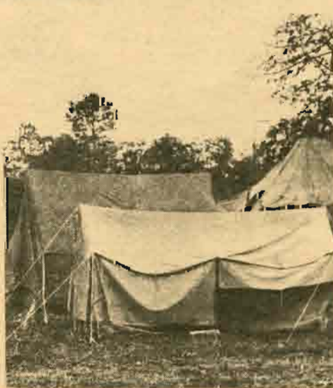
TENT CITY in Lowndes County

houses, you told me I'd get better schools, you told me I'd be a first class citizen. Now I lost my house -- you get me a house.' You see, I can't just walk away, and say 'that's part of it,' those people need a house."