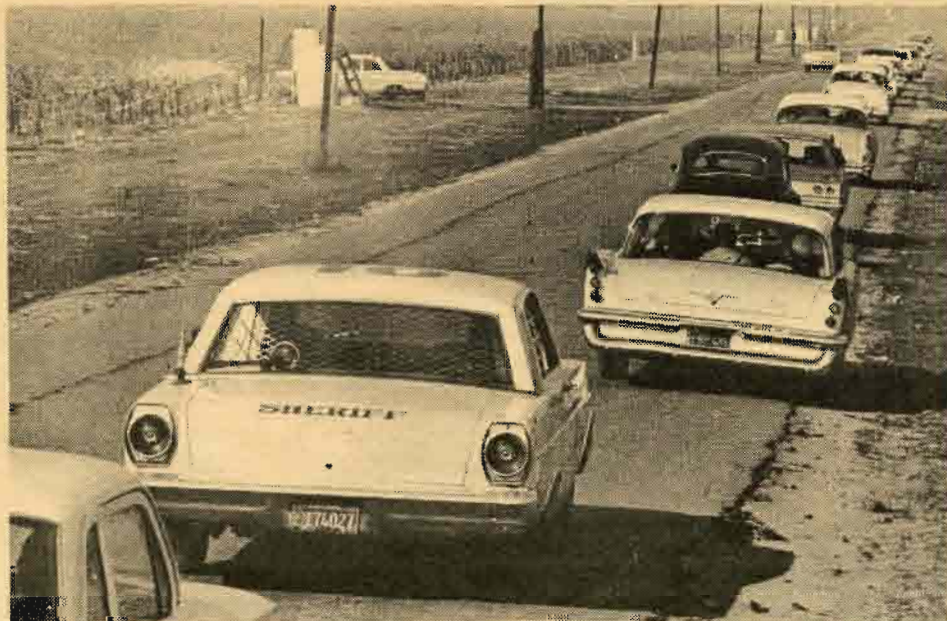
TULARE COUNTY SHERIFF tails 20-car NFWA roving picket line.