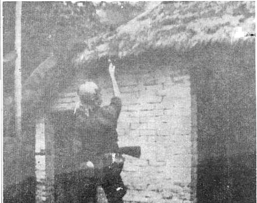
A U.S. MARINE using a cigarette lighter to burn a home in Camne. Marines asserted burning of village was justified by evidence of Communist control. American troops shoot Vietnamese women and children, our planes destroy the homes of farmers and their supplies of food.

lobby will be over 1,000 Mississippians who plan to come the middle of September. FDP workers in Mississippi estimate this number represents about 1/5th of the number of people who would like to come. Money is being raised in the north and in Mississippi to finance the trip. The Student Nonviolent Coordinating Committee has committed its full resources in Mississippi to make this trip possible for the people who are bringing the challenge. During the first week in September, the Mississippians will maintain a vigil outside the Capitol similar to the vigil that was held on January 4th at the beginning of the challenge. The people from Mississippi have called on their friends and supporters in the north to join them in lobbying activities during this vigil. The demonstration is expected to last until Congress votes on the Challenge.